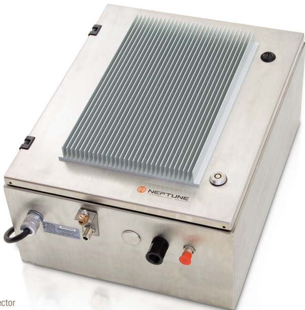
R450 Data Collector

Neptune's R450™ System is an advanced, highly robust, two-way fixed network meter reading solution that delivers comprehensive usage information through a secure, long-range wireless network. The R450 System provides the timely, high-resolution meter reading that enables water utilities to eliminate on-site visits and estimated reads, reduce theft and loss, implement time-of-use billing, and profit from all of the financial and operational benefits of fixed network automated reading and billing.